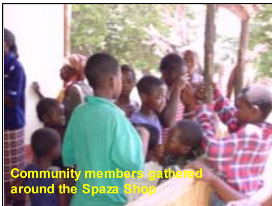
Community members gathered around the Spaza Shop

Rural areas of Southern Africa are often isolated and people often have to travel for hours to get to the nearest retail outlet. After attending the financial life skills training, one re-