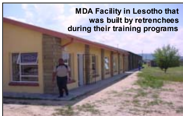
MDA Facility in Lesotho that was built by retrenchedees during their training programs

The care project has provided valuable institutional strengthening and support to project partners such as TEBA, the MDA, Privest Limitada and a host of other developmental service providers. New courses and programmes have been developed (e.g., Electronics Training, Financial Life Skills, etc.). Training has been directly linked to institutional strengthening. Retrenchee