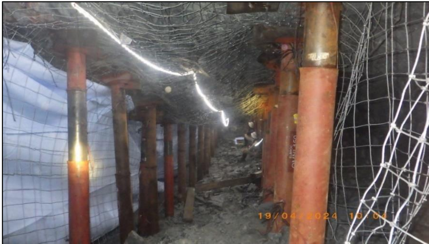
Photos taken on the 19-04-2024 and 22-04-2024