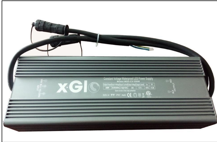
Dual Controller - LED Power Supply

The High PF Constant Voltage Waterproof LED Power Supply for in-stope lighting to be installed by a qualified Electrician.