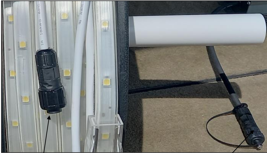
Male Connection on Strip Lights