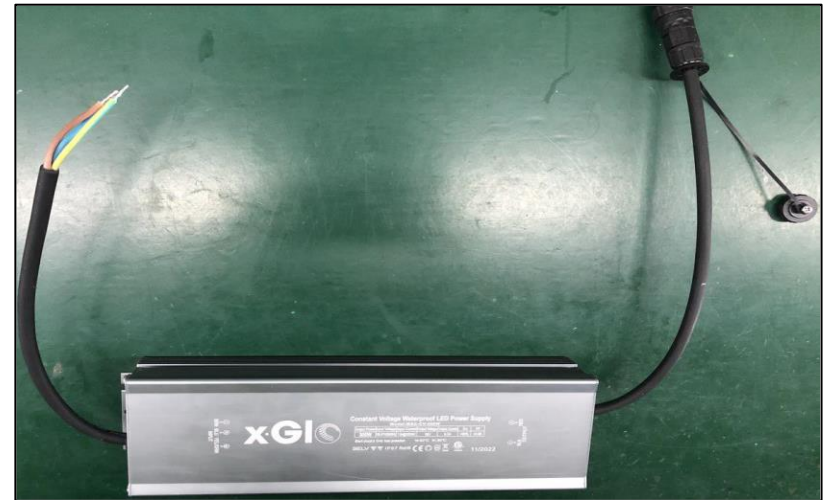
Single Controller - LED Power Supply

Electrical connections – Winch starter and electrical boxes equipped with 36 Volts controller and connection plug.