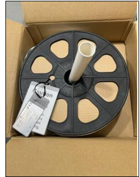
49,95m per roll strip light

Intensity \geq 5000 light spectrum created by 24 LED's / meter.